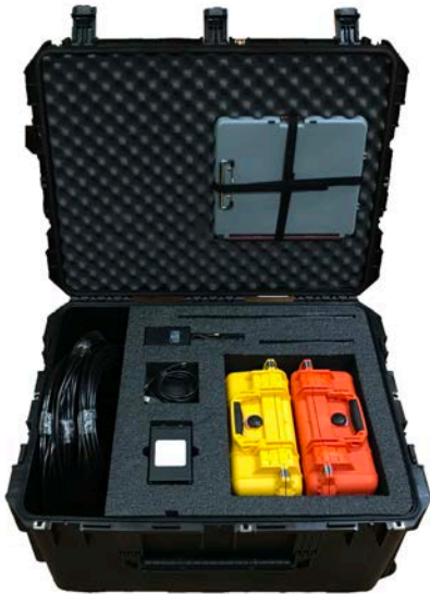
KMS-820 & Web access box in transportation case