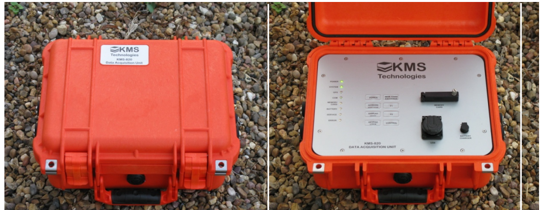
KMS-820 data acquisition unit.

KJT Enterprises Inc. 11999 Katy Freeway, STE 160 Houston, TX, 77079 USA Tel: +713.532.8144 Fax: +832.204.8418 Email: info@KMSTechnologies.com www.KMSTechnologies.com